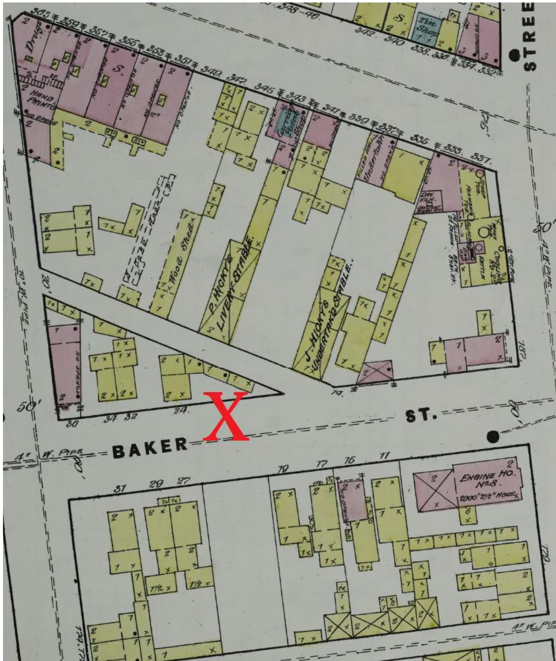
Sanborn Fire Insurance Map from Detroit, Wayne County, Michigan. Sanborn Map Company, Vol. 1, 1884. Map. Retrieved from the Library of Congress, https://www.loc.gov/item/sanborn03985_001/ . (Accessed January 18, 2018.)

A simple wooden structure, attached to a home next door, was constructed on this site around 1855, but it was not the house that stands there today. It appears in the 1884 Sanborn fire insurance map, below. The X marks the location of 1242 Bagley today.