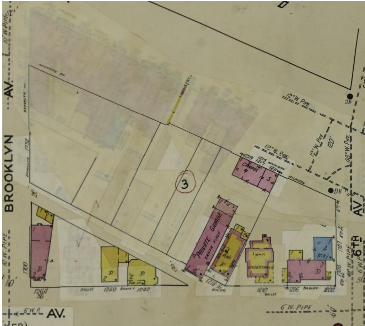
1242 Bagley as it appears in a 1950 anborn fire insurance map. Sanborn Fire Insurance Map from Detroit, Wayne County, Michigan. Sanborn Map Company, Vol. 9, - Feb 1950, 1950. Map. Retrieved from the Library of Congress, https://www.loc.gov/item/sanborn03985_055/ . (Accessed January 18, 2018.)